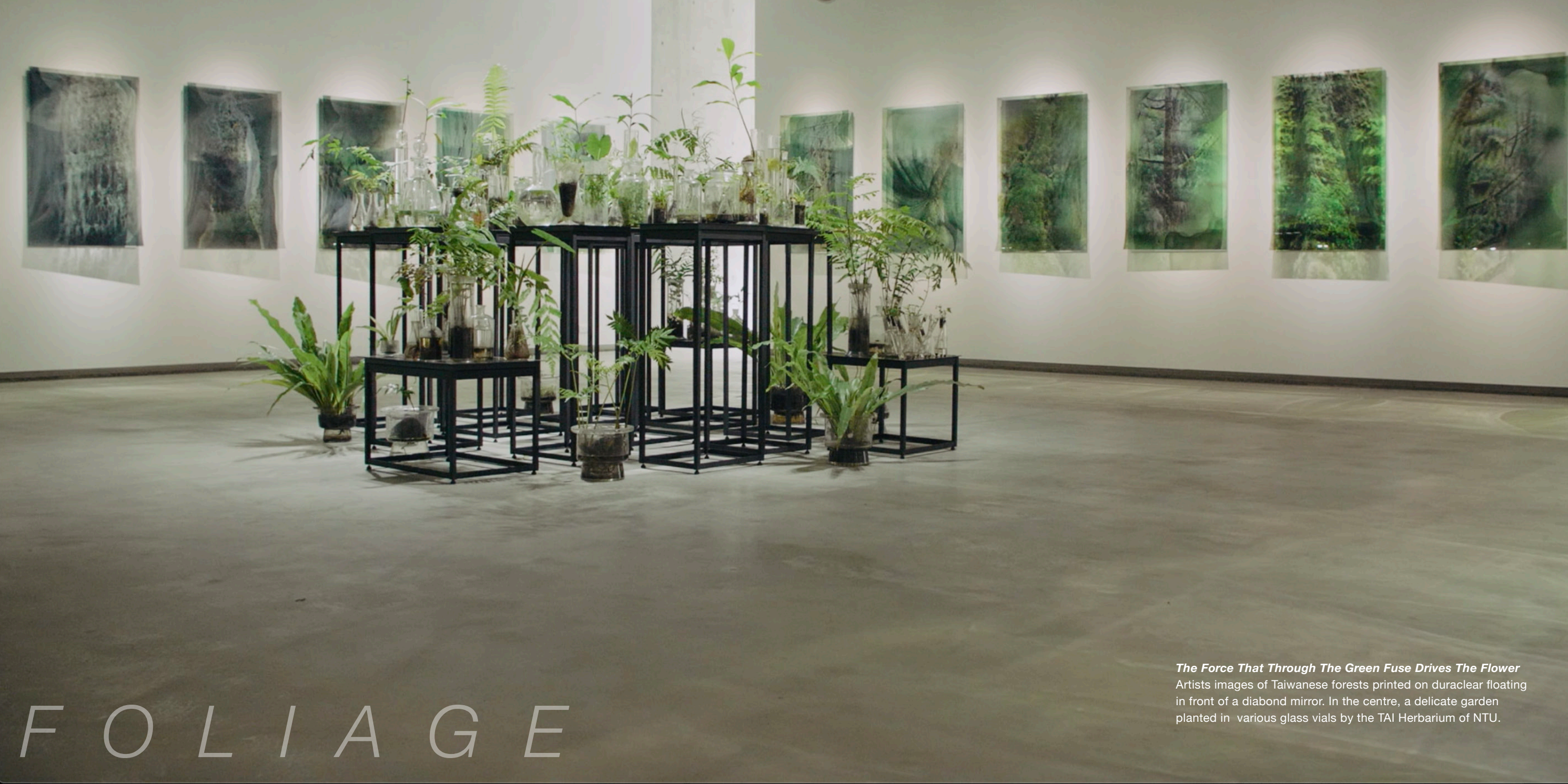
The Force That Through The Green Fuse Drives The Flower Artists images of Taiwanese forests printed on duraclear floating in front of a diabond mirror. In the centre, a delicate garden planted in various glass vials by the TAI Herbarium of NTU.