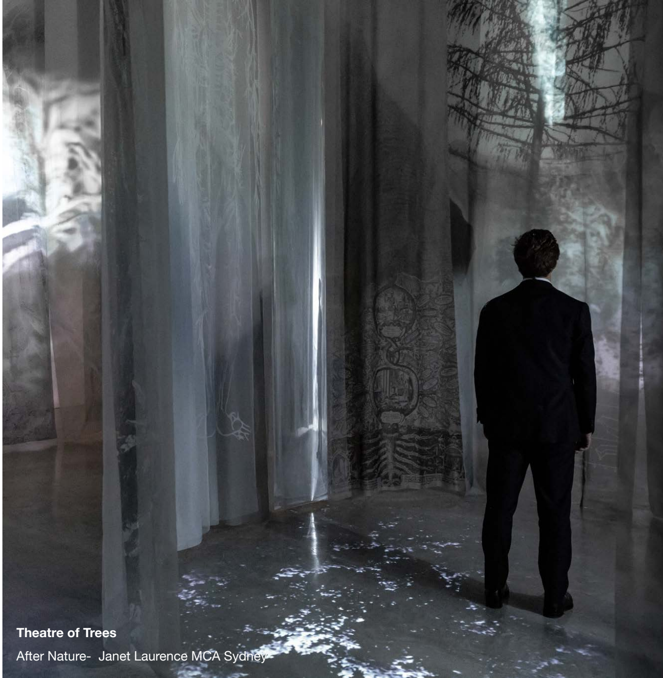
Theatre of Trees