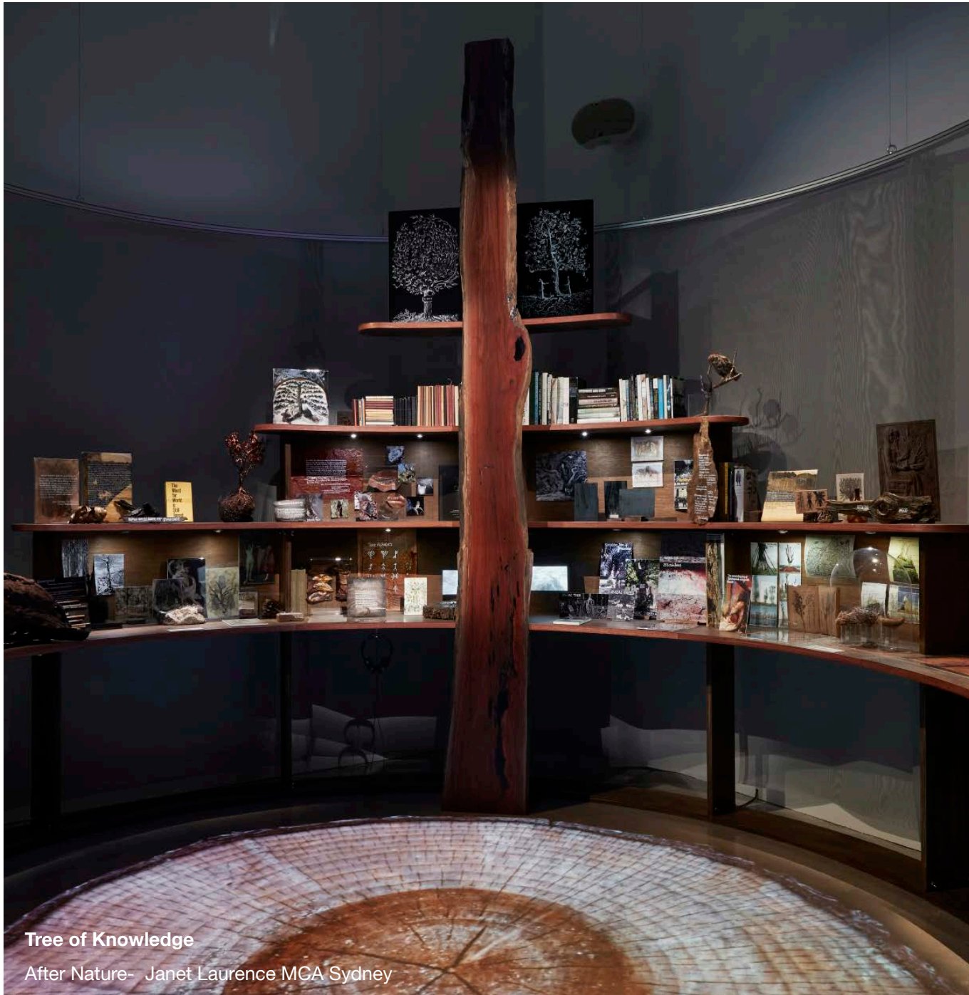
Tree of Knowledge